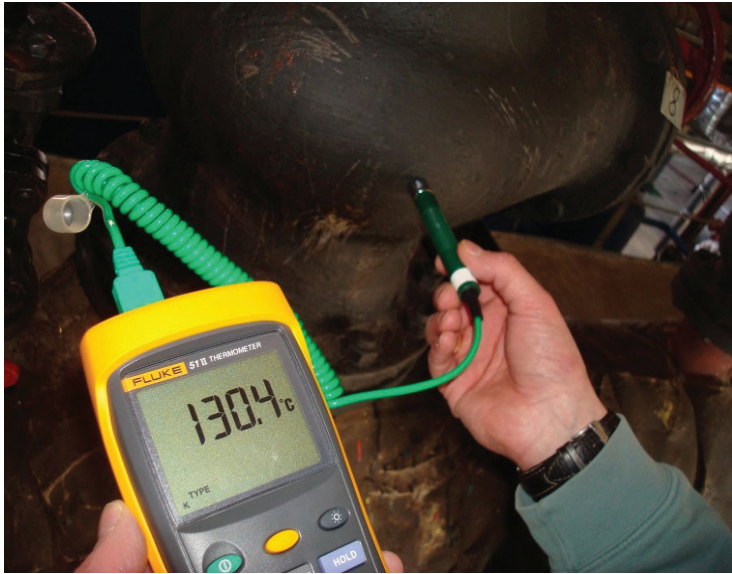
BEFORE COATING TEMPERATURE