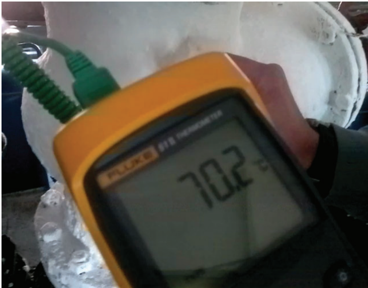
AFTER COATING TEMPERATURE

Pipe surface temp was 130°C during application of CharCoat CTI. Multiple heavily diluted brush applications until bubbling stopped, then a regular brush application to give desired total thickness (~4mm).